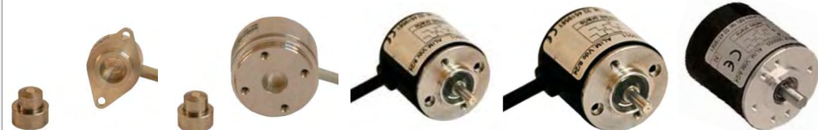
RM22-I RM36-I E30 E40 E40A