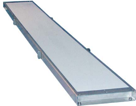
Flat sensor FL

Flat sensors are proper for applications where the test material is transported planely on a conveyor belt or a chute. Products like fabric or foil can also be checked on metal without problems. Unlike other flat sensors the FLs' working principle is based on a balanced coil system which provides for highest sensitivities. In combination with our high-capacity operating electronics it is possible to fade out product effects and other interferences. The robust, long-living stainless steel housing can be mounted easily.