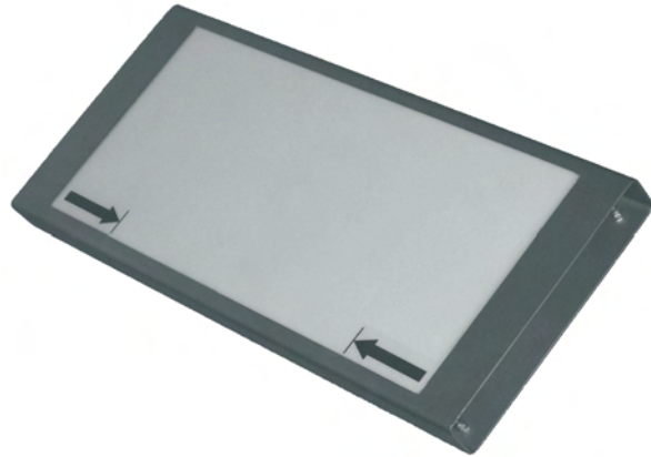
Flat sensor FL

Depending on the operating electronics the handling is realised via a membrane keyboard and a LC-display. Thus all important parameters can be viewed easily and fast and changed if necessary. The sensitivity of the detector also is adjustable this way. Detailed information you will find in the documentation of the electronics M-Pulse and Digital+.