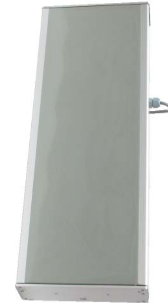
Flat sensor MESEP® SP

The sensor has a dynamic working principle which means it only detects moving metallic pieces in the sensor range. If a non-moving metal piece is situated in the detection range, it does not excite a signal and therefore is not detected. Contrary to sensors with a static working principle this system allows operation with a much higher sensitivity. Thus even small metallic pieces can be detected dead reliable. The operation of the sensor requires a control unit. This realises the voltage supply for the sensors and allows the adjustment of all parameters. The detailed functioning and handling depends on the control unit.