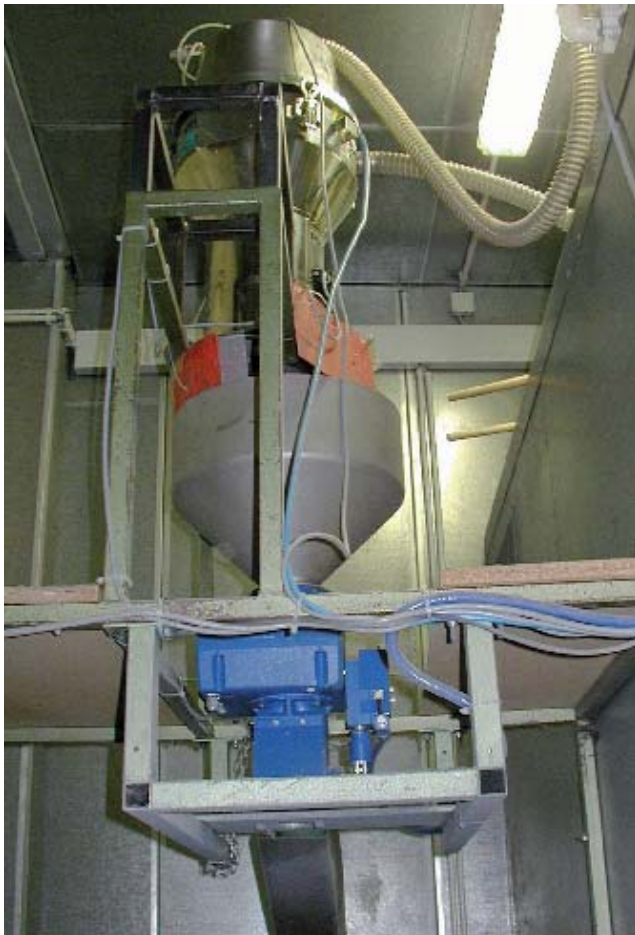
MESEP SE 50 for the inspection of granulates in the plastics industry.